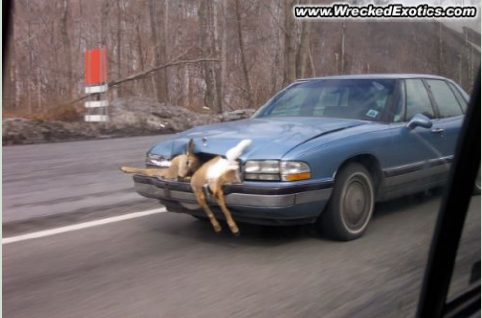
How does someone not realize there is a deer stuck in the grill of their car? www.wreckedexotics.com

“Unless we make Christmas an occasion to share our blessings, all the snow in Alaska won’t make it ‘white’.” ~Bing Crosby